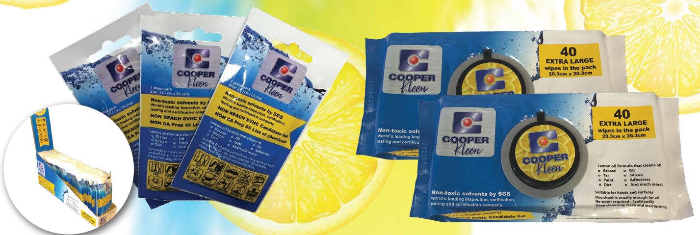
COOPERKLEEN60 60 SINGLE PACK MERCHANDISER